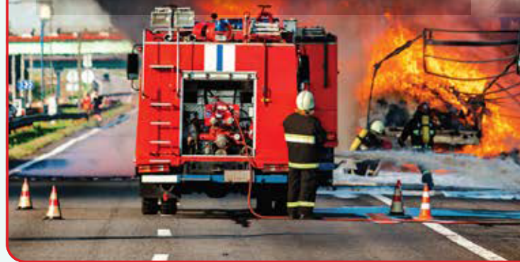
Internal comparison tests of identical NMC/graphite cells with and without Impervio demonstrate the separator's significant safety advantages.

In new testing conducted at 24M labs, battery cells fitted with the Impervio separator demonstrated robust performance without shorting or overheating through a full hour of overcharge. Without Impervio, the cell experienced an internal short within 15 minutes and caught fire after 30.